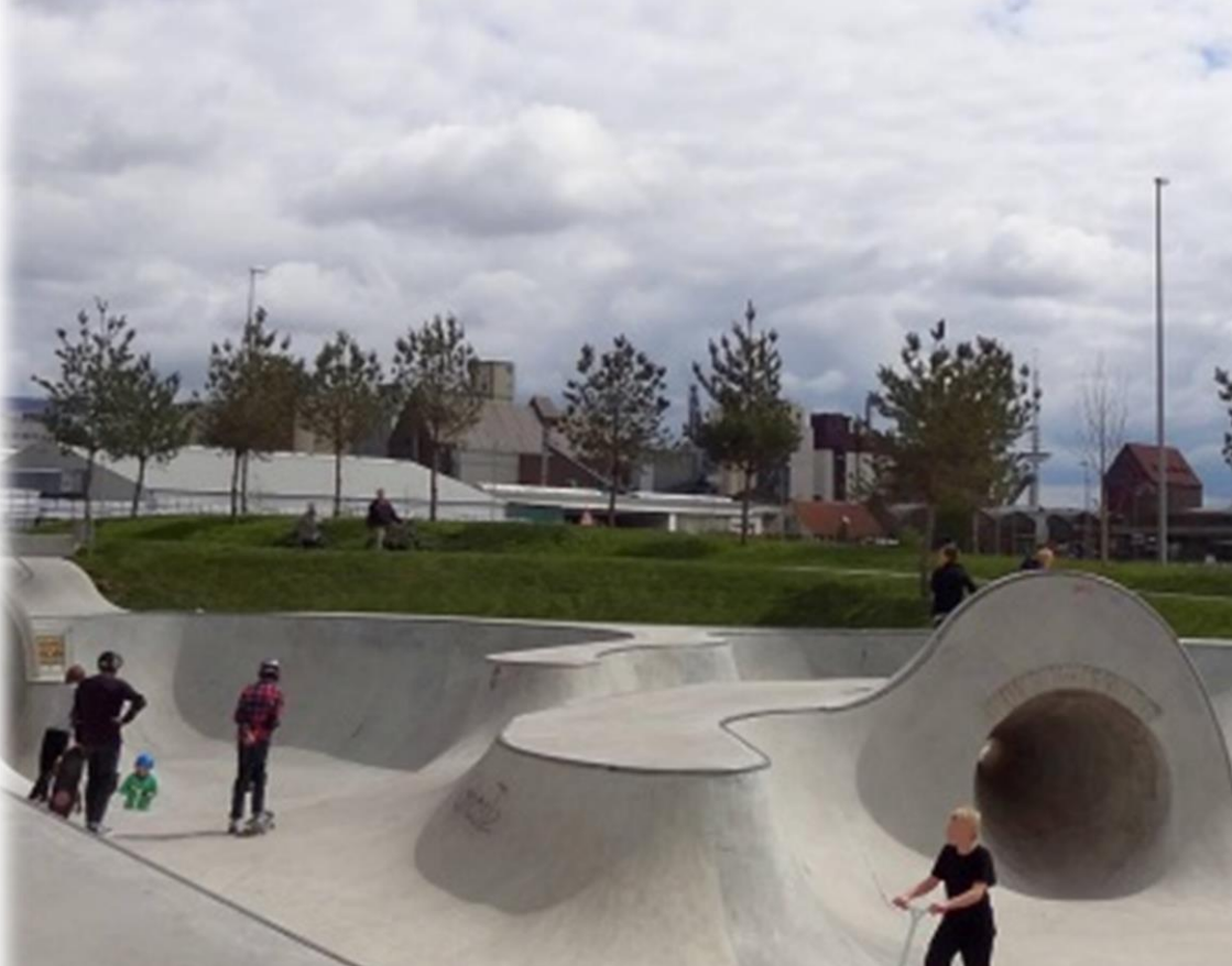
A space for young people